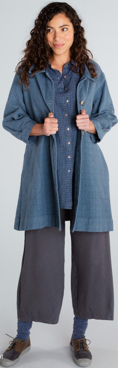
5898786/Tidal/ Smock Coat 4596276/Tidal/Easy Shirt 2405521/Tidal/Convertible Boatneck Tank 2242088/Iron/Crop Pant w/ Darts