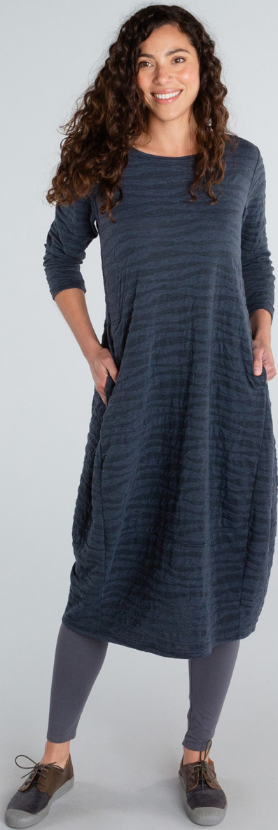
6941654/Tidal/3/4 Slv Dress 240300/Iron/Full Length Legging