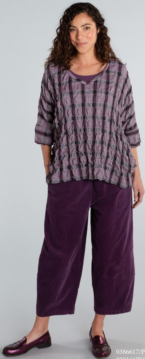
0386617/Plumeria/V-Neck Top 02016679/Plumeria/Scoop Neck Top 0032388/Plumeria/Lantern Pant