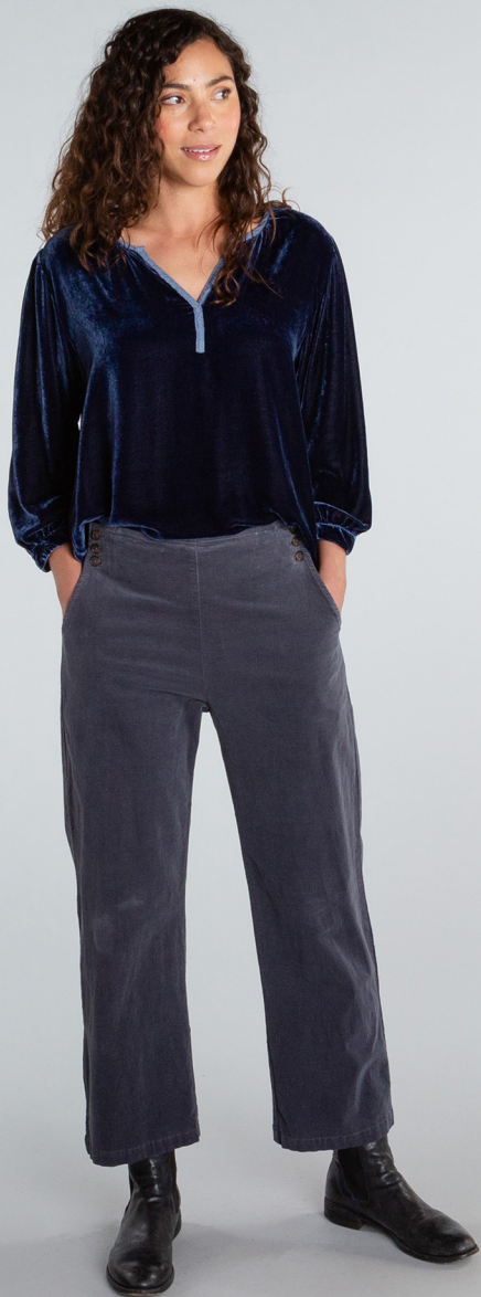
6996892/Tidal/3/4 Slv Henley Top 0032853/Iron/Ankle Trouser