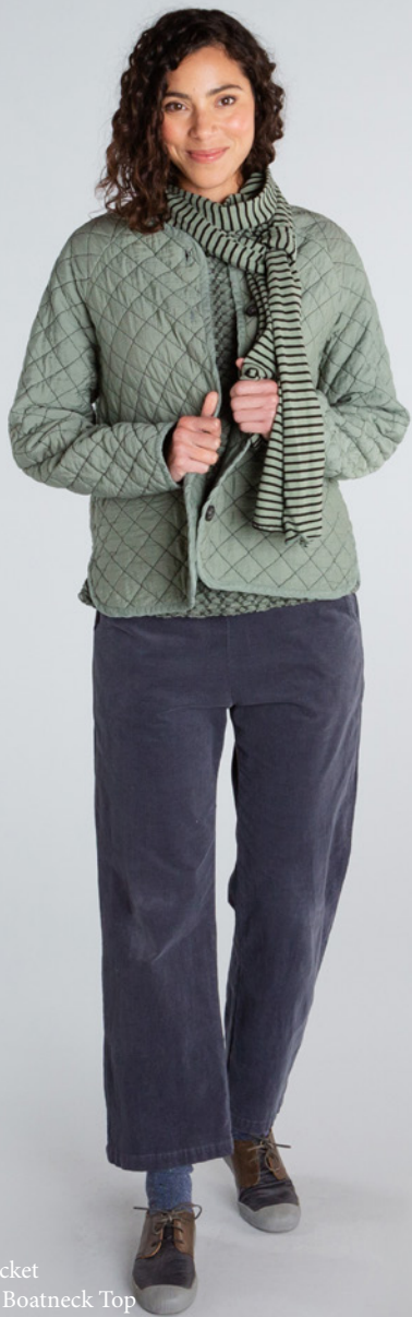
6598995/Tarragon/Easy Jacket 6665060/Tarragon/3/4 Slv Boatneck Top 0032853/Iron/Ankle Trouser