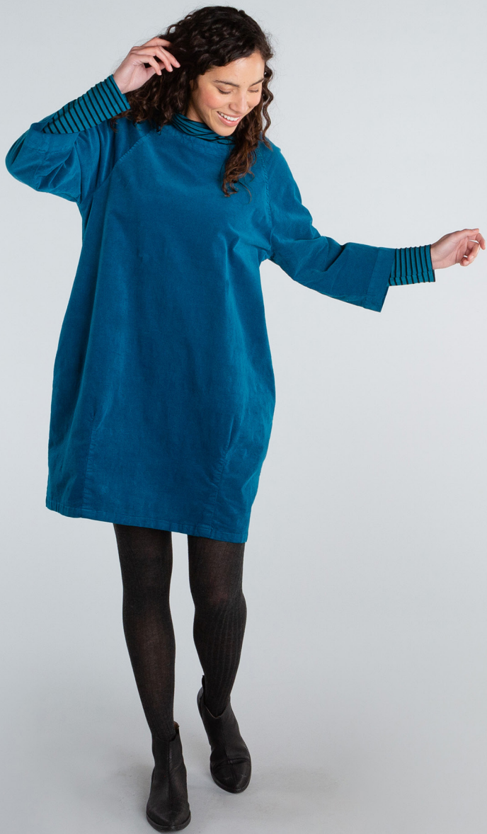
0031673/Deep Sea/Raglan Dress 6037099/Deep Sea/L/S Turtle Neck